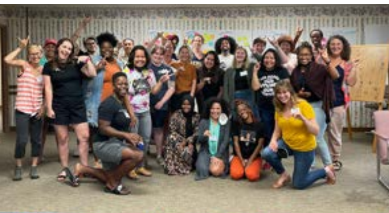
TSAT in partnership with We Make the Future, Indiana

We shifted the TSAT to a regional and residential model, where many participants are local and live on-site for 3-days. This shift simultaneously allows us to deepen regional partnerships and remain responsive to the realities of COVID. This program year, we offered the TSAT three times: